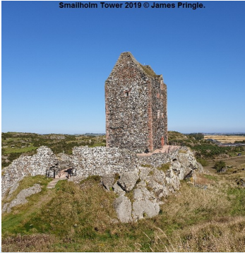
Smallholm Tower 2019 © James Pringle.