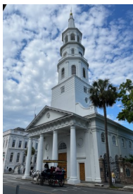
St Michael's 71 Broad St