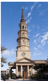
St Phillip's 142 Church St