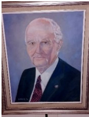
My wife painted this portrait of my Dad